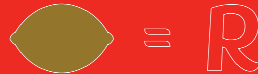
Fig. 3 ... The Real Lime